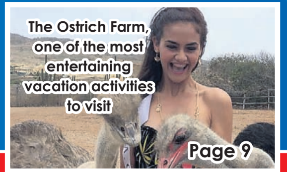
The Ostrich Farm, one of the most entertaining vacation activities to visit